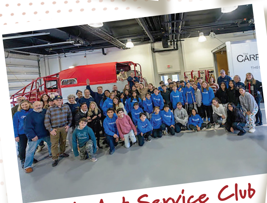
Early Act Service Club